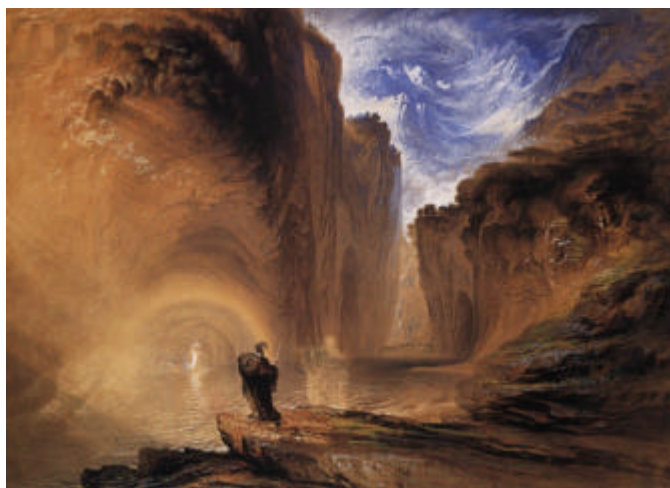
Manfred and the Witch of the Alps by John Martin