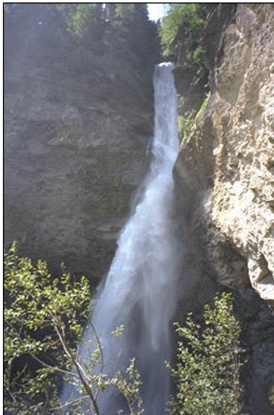
The Reichenbach falls

Set out at seven – up at five – passed the black Glacier – the Mountain Wetterhorn on the right – crossed the Scheideck mountain – came to the Rose Glacier – said to be the largest & finest in Switzerland. – I think the Bossons Glacier at Chamouni – as fine – H[obhouse]. does not – came to the Reichenback waterfall – two hundred feet high – halted to rest the horses – arrived in the valley of Oberhasli – rain came on – drenched a little – only 4 hours rain however in 8 days – came to Lake of Brientz – then to town of Brientz – changed – H[obhouse]. hurt his head against door. – In the evening four Swiss Peasant Girls of Oberhasli came & sang the airs of their country – two of the voices beautiful – the tunes also – they sing too that Tyrolese air & song which you love – Augusta – because I love it – & I love because you love it – they are still singing – Dearest – you do not know how I should have liked this – were you with me – the airs are so wild & original & at the same time of great sweetness. – –